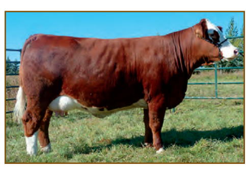
Whisper — Fall sister to Radium