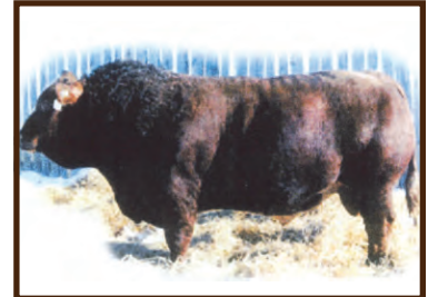
SAMURAI SAM FATHER OF ELFIE

ANCHOR D SEISMIC 165T DAM: GOLDEN DAWN ELFREEDA DESS FARIRYTALE 71S