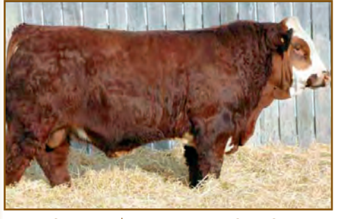
Radison — $26,000 son of Radium

BHR DOORN G629E DAM: CROSSROADS PANDITA 308P RIVERBEND BRIDGIT 15A