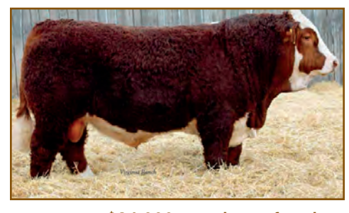
Precision — $24,000 grandson of Radium