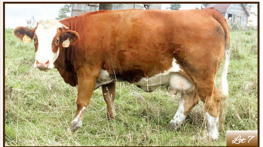
REGISTRATION #: 3136218