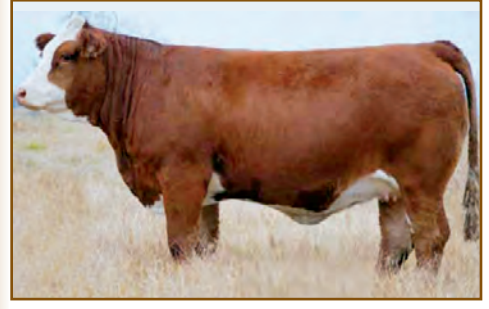
Rieda — $31,000 daughter of Radium

Radium has proven over and over to be one of the top Fleckvieh sires in North America. Calving ease, disposition, udder quality, pelvic area and color. That is a lot for one bull! His sons and daughters topped a number of Canadian sales and continue to be in strong demand. Radium spend his first seven years in Canada and the last four with us. Radium covered 35 heifers this spring. Featured in the sale are several direct daughters of Radium and five spring calving bred heifers that are carrying Radium calves. Radium now resides "in the big pasture".