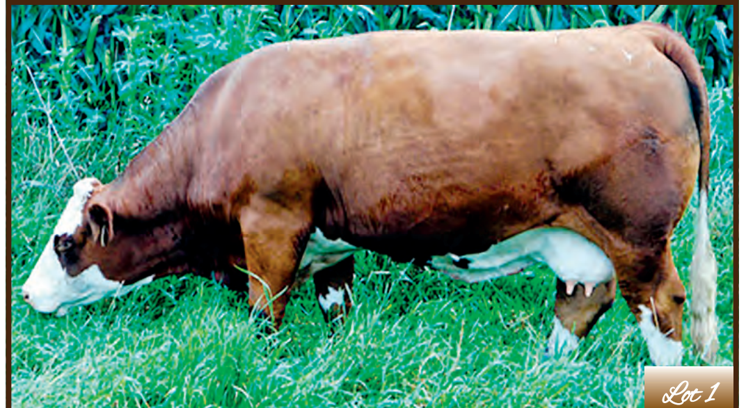
REGISTRATION #: 2609775