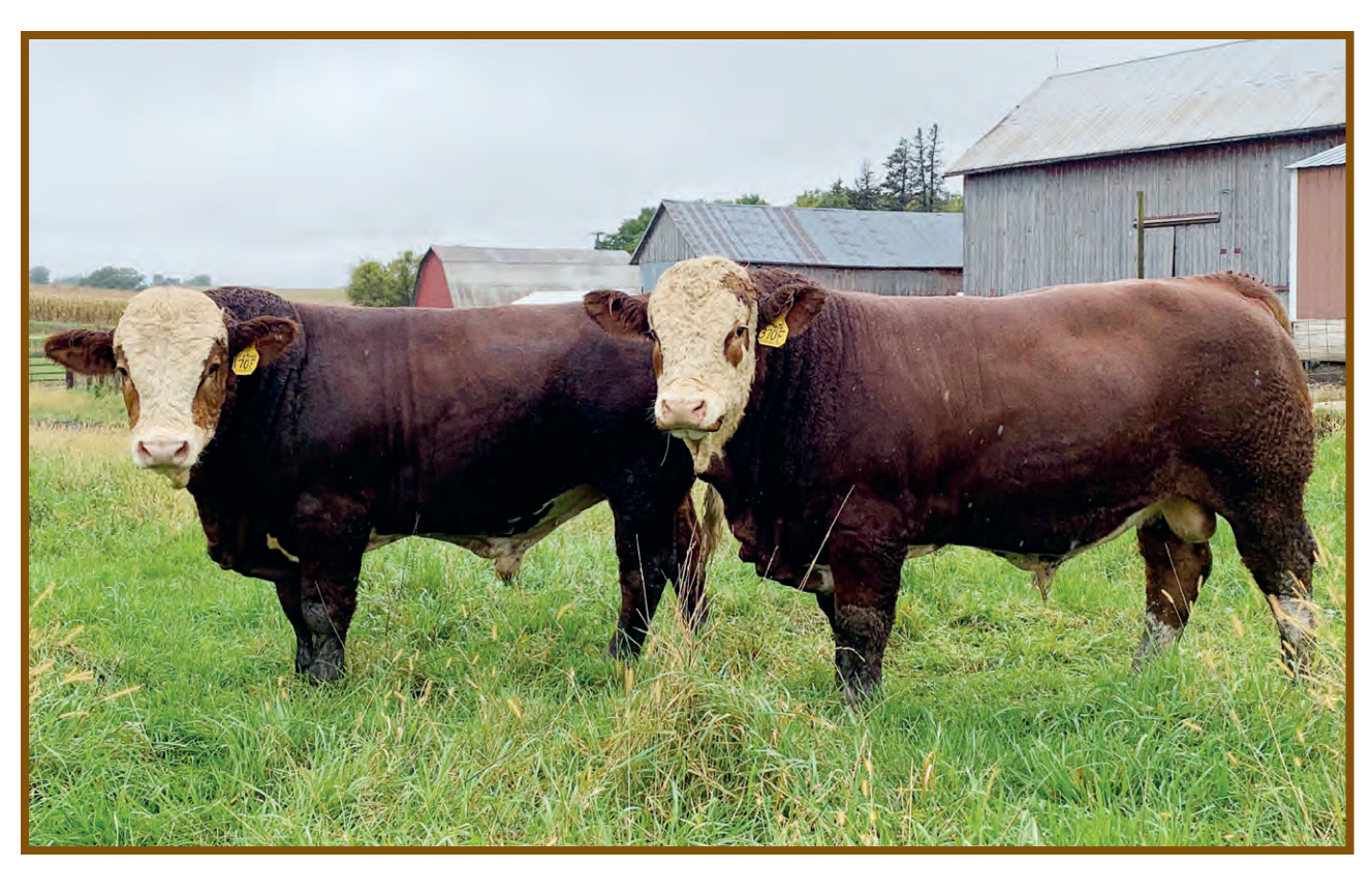
Pictured left to right, Landlord and Lumber Jack.

Landlord is sired by Ft. Knox. Ft. Knox is also the service sire to several of the females. Lumber Jack's grandmother sells as lot 15 in the sale.