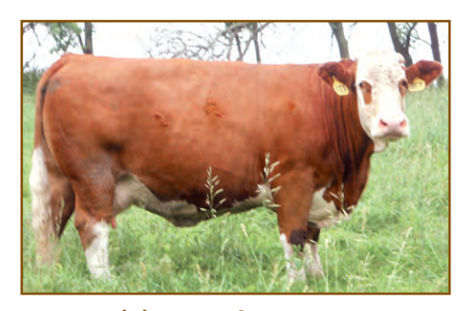
Beulah 155E - Sister to Yuma

Yuma is one of the most impressive bulls we have seen. When you see Talladega and Whistler in the pedigree you expect muscle. And Yuma has got it. Yuma has been extra special from the day he was born. Talladega, Yuma's sire, was also purchased as a proven bull. By buying proven bulls you can go to the farm and see daughters in production. You can see their udders, feet and legs, disposition and production ability. It takes all the guess work out for me and you! Talladega is now gone but his influence is still in full force with his two sons Yuma and Gentleman Jim. We have successfully used Talladega and Gentleman Jim on heifers and we are now considering Yuma. Yuma daughters are great producers. We do not sell many Yuma daughters!