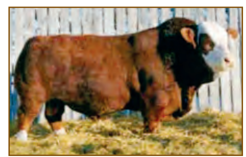
Destiny — Maternal sister to Titan