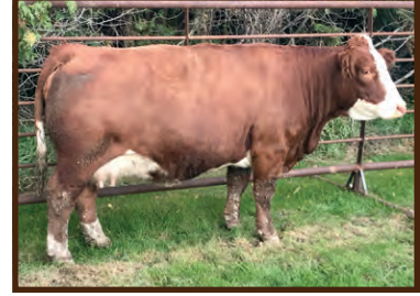
28C MOTHER OF BELLE

DDD BROADWAY G534 DAM: GIBBONS BELLE 28C GIBBONS BELLE