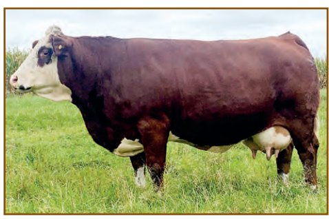
Britches 792Uc - Sister to Yuma

GIDSCO APPOLLO 3F SIRE: TRI-R TALLADEGA 24T SMITHBILT MITZI 134M