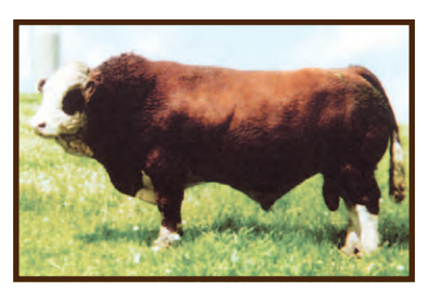
TALLADEGA FATHER OF CASEY