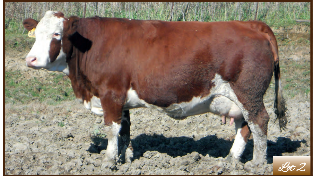
REGISTRATION #: 2822778