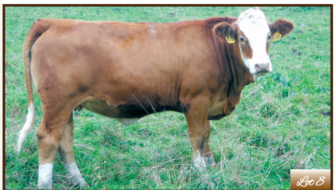
REGISTRATION #: 3620921

ANCHOR T IKON 1H SIRE: HEMR SAMURAI 7S JB CDN KANANASKIS 4019