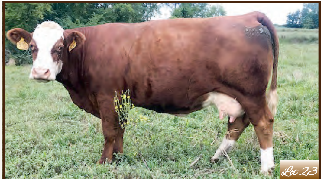
REGISTRATION #: 2800340