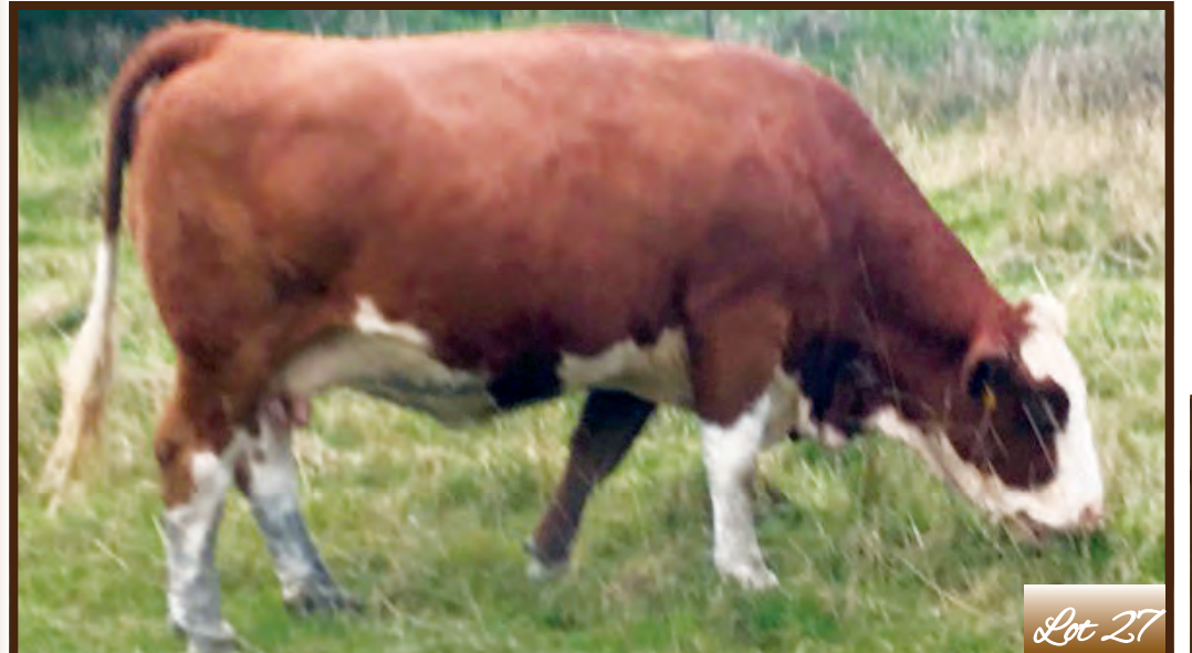
REGISTRATION #: 3543587