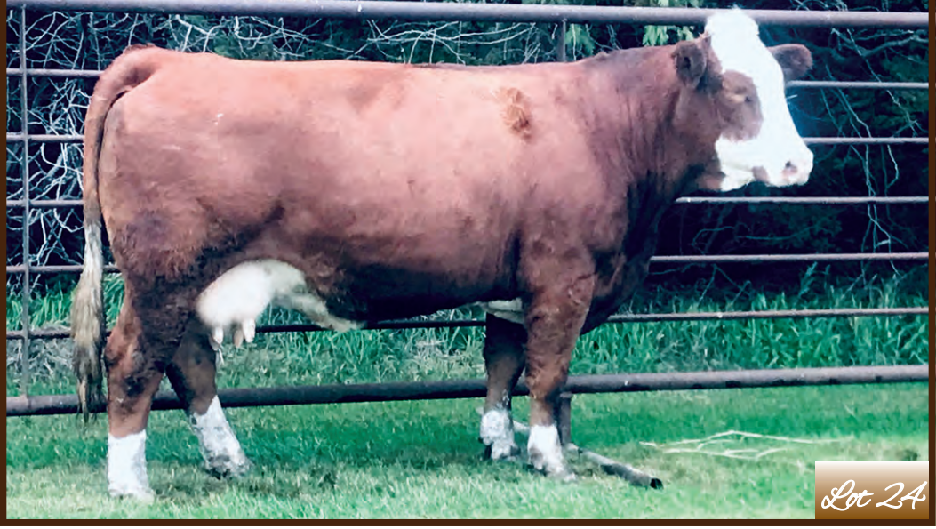
REGISTRATION #: 3123636

DT220 is very close to picture perfect. Dark red, solid colored with large goggles. 220 produces as good as she looks which is proven by her fancy Yuma daughter that we are retaining. This cow is unrelated to most U.S. cattle, which only adds to her value! We have always had good results with the animals we have purchased in Canada. Usually very robust, easy keeping cattle. 100% Fleck. Exposed to Ft. Knox May 2, 2019.