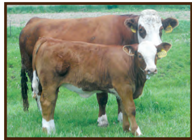
KENDALL WITH TITAN HEIFER CALF