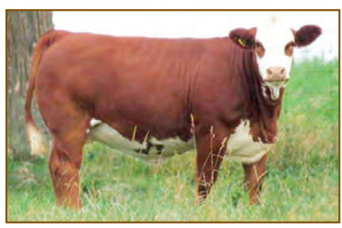
Zdenoa — $18,000 granddaughter of Radium

BAR 5 SA EVAN 440L SIRE: MF MR. EVAN 14P BHR LADY SUZETTE 207K